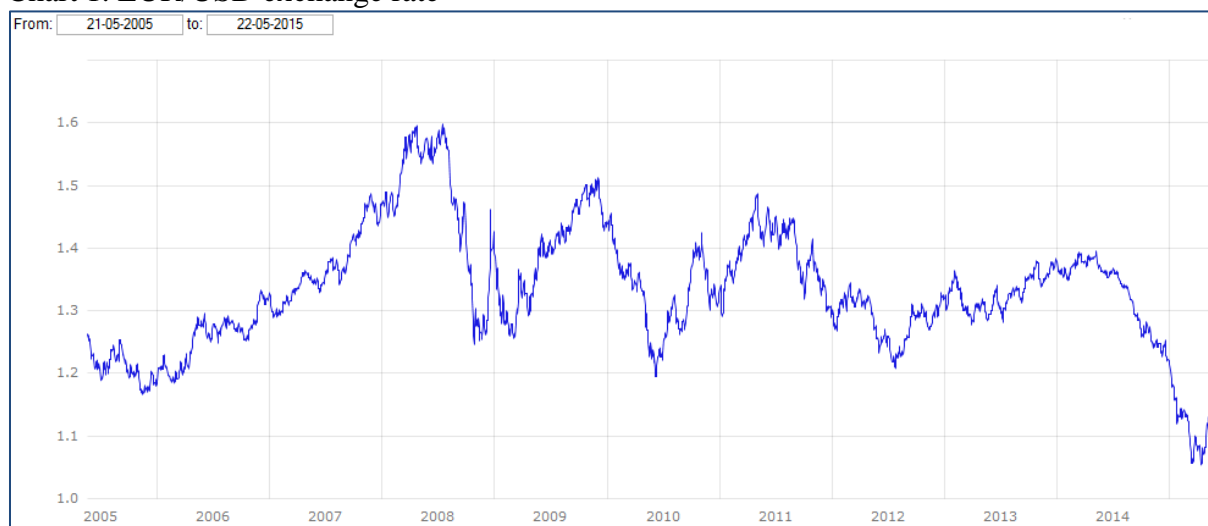
Chart 1. EUR/USD exchange rate

Source: https://www.ecb.europa.eu/stats/exchange/eurofxref/html/eurofxref-graph-usd.en.html